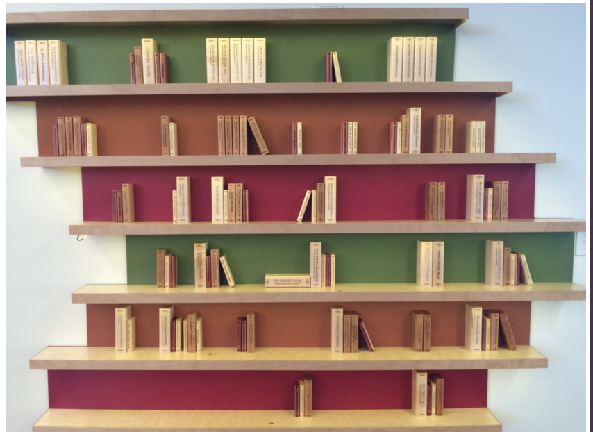
Photo of the Book Spine Display on the 3rd Floor

The funds raised will be used to purchase furniture, equipment and art for the beautiful new Nampa Public Library. Each book is laser engraved with the text of your choice. Book spines can be ordered by filling out the form on the back, or by visiting: www.nampalibrary.org